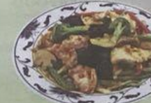
Chicken w. Garlic Sauce