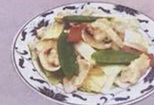
Moo Goo Gai Pan