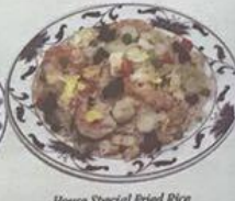
House Special Fried Rice