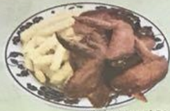
Chicken Wing with Fried Fries