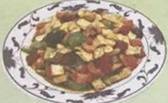
Chicken w. Cashew Nuts