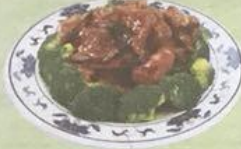
General Tso's Chicken