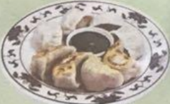
Fried or Steamed Dumpling