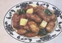
Sweet & Sour Chicken