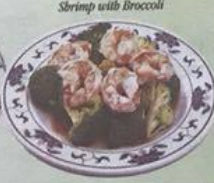
Shrimp with Broccoli