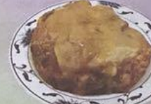
Egg Foo Young